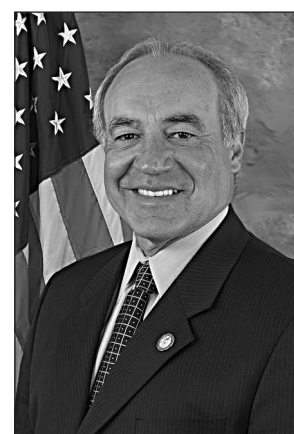
Congressman Joe Baca