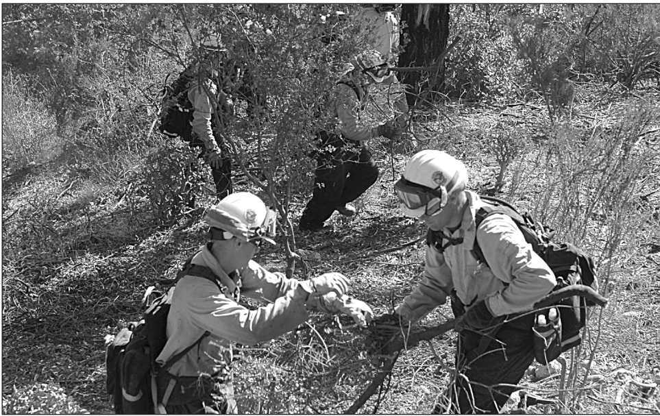
Hot Shot crews pay attention to the native vegetation to make sure they're not cutting down precious plants.