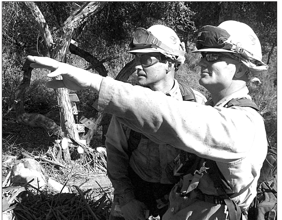
Two members of Sycuan’s Golden Eagles Hot Shots crew inspect the landscape as they clear a large canyon in the Golden Hill area of San Diego.